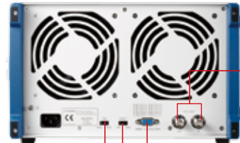
FAN Speed Control Switch