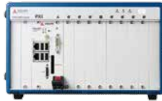
PXES-2590 Front View