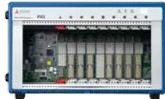
PXES-2590 Hybrid Peripheral Slots