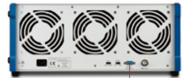
Remote Monitoring Port

The PXIS-2719A has a built-in control board monitors and manages chassis status, including internal temperature, fan speed, and voltages. Using the RS-232 monitoring port, the chassis status information can be exported to another computer for remote management. The control board can also accept commands from the remote system to allow remote power on/off and fan speed control of the PXIS-2719A chassis.